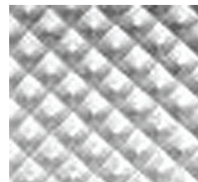
.125 Prismatic Acrylic Lens Standard

Antimicrobial: Agion™ Antimicrobial protection using silver technology inhibits bacterial colonization on metal interior and exterior surfaces. Agion™ antimicrobial FDA recognized and EPA registered, meeting all applicable EPA standards.